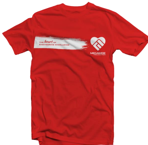
Photo 20: Volunteer Shirt with printed new Megawide Foundation Logo and Branding

As part of the Foundation's promotion and awareness campaign, the Foundation developed its branding guidelines and policy this year. As the Foundation slowly gains momentum to inspire its stakeholders and partners to reach a common goal, the Foundation pushed for the new information campaign materials to disseminate and make the message vibrant to all. The Foundation spent at least PHP 78,800 for this year.