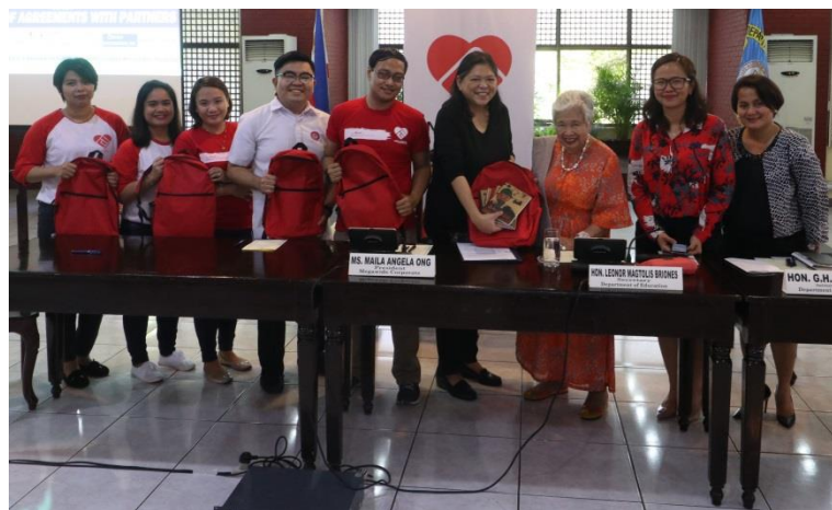
Photo 13: Megawide Foundation Launched the Red Backpack Project during the DepEd MOA signing for the Adopt-a-School Project.

The Foundation launched the project in response to the call of the Department Education to support the Marawi children who were displaced during the war. The project was able to reach at least 600 elementary school kids scattered nationwide to continue their schooling. The foundation spent a total of Php 170,500.00 for this project.