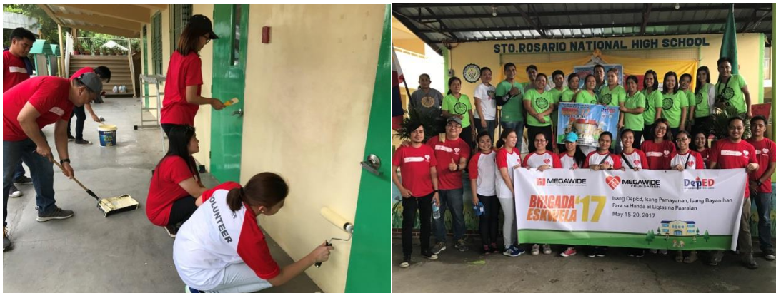
Photo 16 and Photo 17: Megawide Foundation together with the volunteers from Megawide Construction attended the 1st brigada eskwela in various locations in Luzon

This is the first time Megawide Foundation joined the Brigada Eskwela program. 296 volunteers from various partner companies, the local communities, and employees were mobilized to restore classrooms and other school facilities in the various sites. The project positively affected 2,500 schoolchildren. Partners who joined the nationwide undertaking were Megawide Construction Corporation, Megawide Industrial Complex, Citicore Power, Inc. (CPI), CPI subsidiaries Silay Solar Power, Inc., Next Generation Power Technology Corp., First Toledo Solar Energy Corp., and local barangay councils and communities. The Foundation spent Php 85,000 for this event.