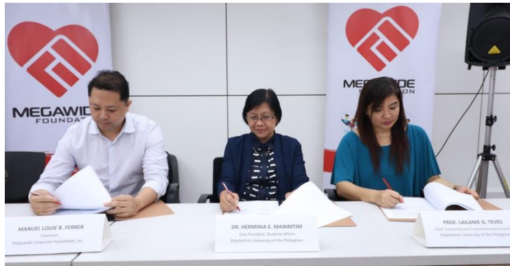
Photo 1: MOA Signing with PUP Administration, Megawide Foundation, and Megawide Construction Corporation for the Megawide Engineering Excellence Scholarship.