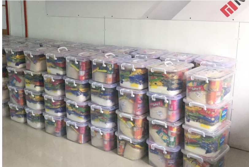
Photo 18: pic of grocery packs for that will given to the informal settlers for the upcoming Christmas outreach.

Megawide Foundation continues to recognize the contribution of the 610 utility personnel, security guards, messengers, and drivers assigned to the Company's head office and its numerous sites. This year, each service staff was given a Christmas pack containing ingredients for a family dinner or Noche Buena .