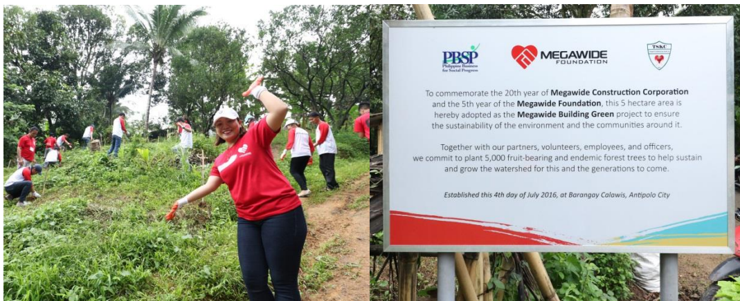
Photo 11 and Photo 12: Megawide Foundation representatives together with the employee volunteers started the planting activity downhill (right). During the event, Megawide Foundation installed a marker to commemorate the partnership between the Foundation, PBSP and TSKC.