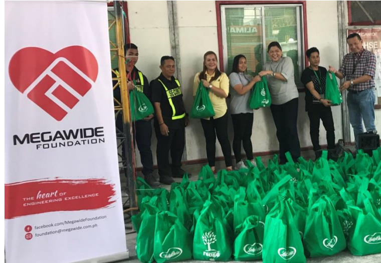
Photo 19: Megawide Foundation together with Officers of Megawide Construction Corporation turnover the Notche Buena packs to the project sites.