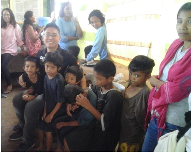
Photo 10: Young boys' line up for their turn during our Operation Tuli project in Bataan and cebu. Volunteers provided entertainment and learning sessions with the young boys during the outreach.

A 3 year project called 'Megawide Building Green Support to the Marikina Watershed Project' was conceptualized in partnership with the Philippine Business for Social Progress to support the Marikina Watershed Initiative Program (MWIP) through the restoration of the natural ecology of the watershed reserve in Antipolo, Rizal. For the 3-hectare reforestation site, 1,875 forest tree seedlings endemic to the area were planted on 4X4 square meter plots. Another 2 hectares of agro-forestry were also enhanced through planting of various types of fruit-bearing seedlings (1,250 seedlings).